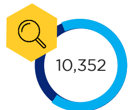
Total Number Ultimate Plastic Search