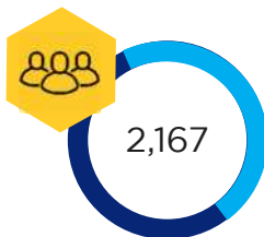
Total Number of Participants (People)