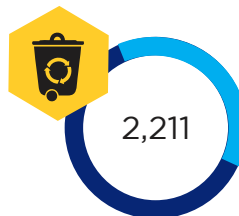
Total Number of Non biodegradable Waste