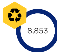
Total Number of Recyclables