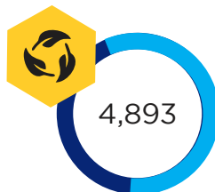
Total Number of Biodegradable Waste